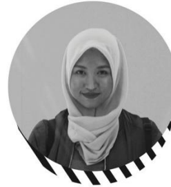
SAQILA SAMPETODING MARKETING