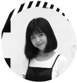
ARVELLA NATHANIA CREATIVE